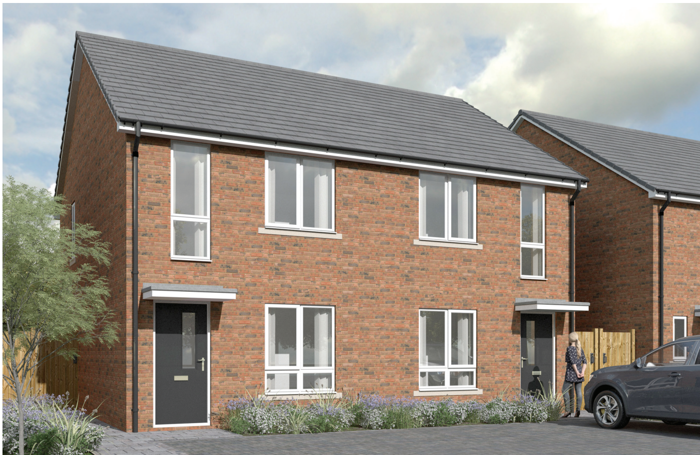
CGI Drawing of a typical plot