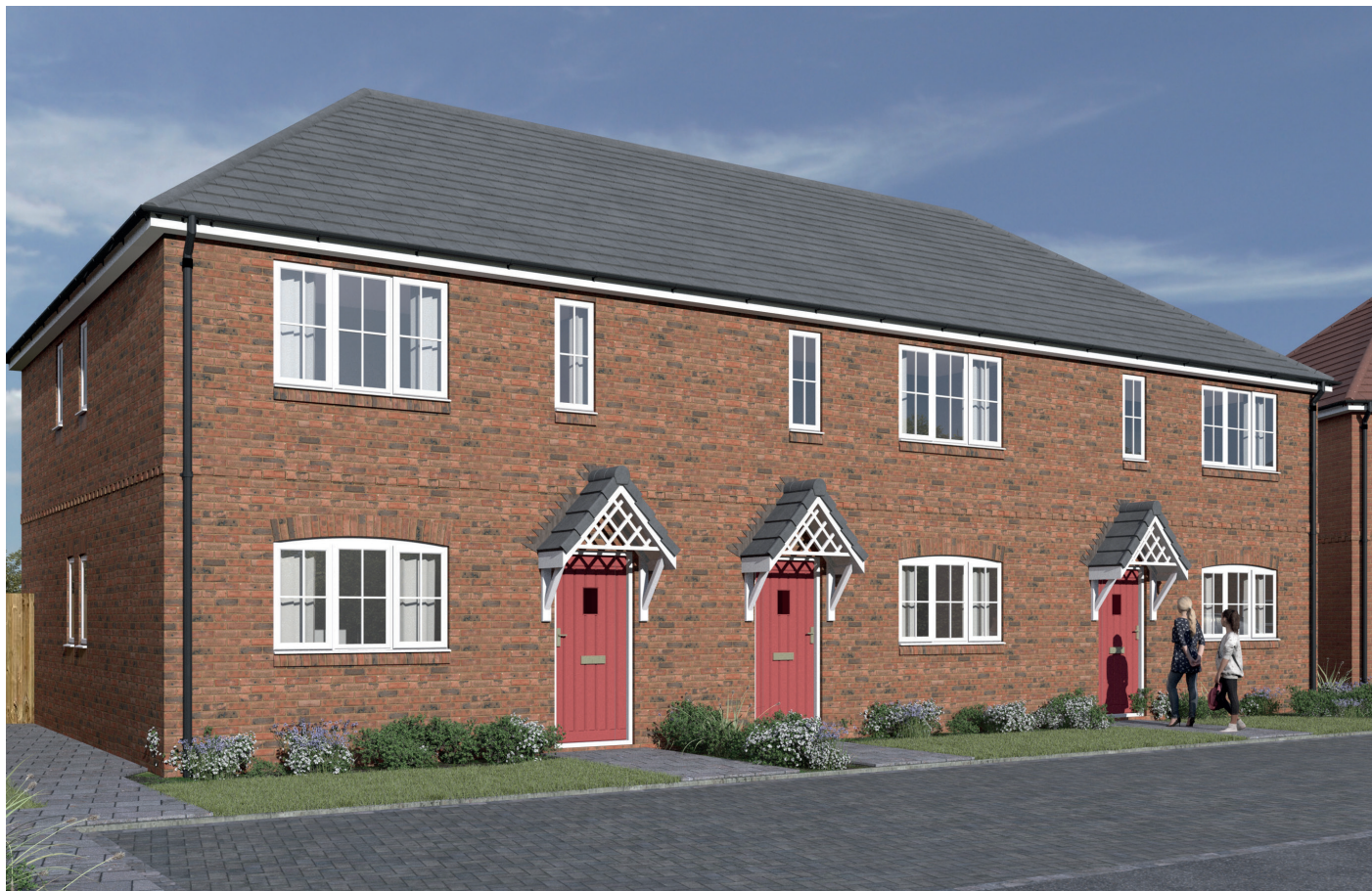
CGI Drawing of a typical plot

Plots 31, 32, 33, 34, 35, 36, 37, 38, 39, 40, 41, 48, 49, 50, 51, 52, 53, 54, 58 & 59