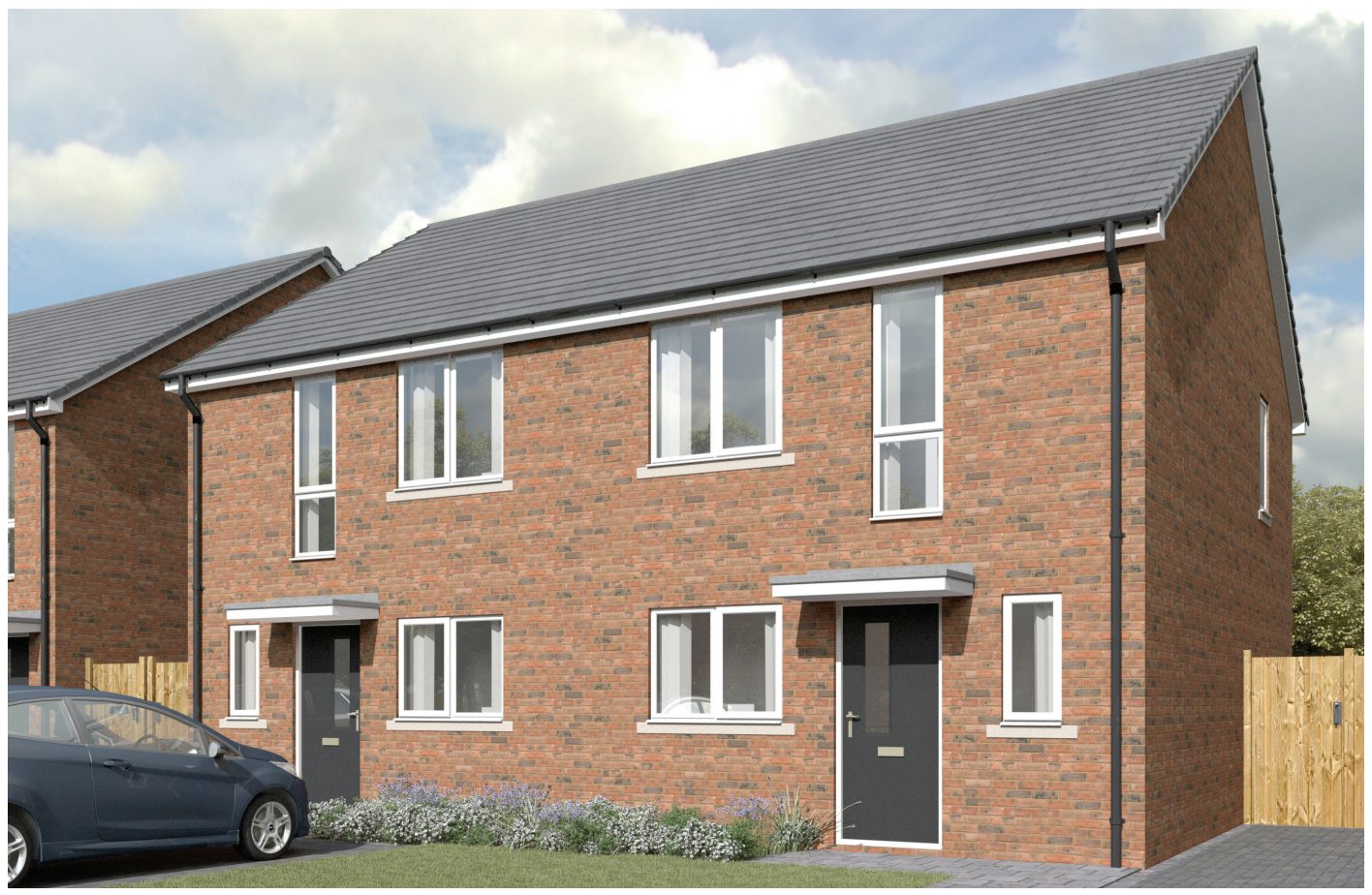
CGI Drawing of a typical plot