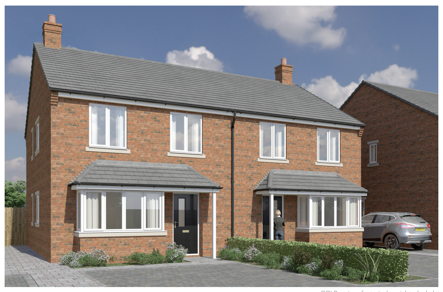
CGI Drawing of a typical semi-detached plot