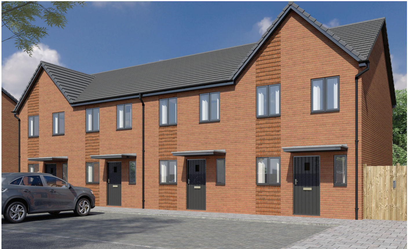
CGI Drawing of a typical terrace plot